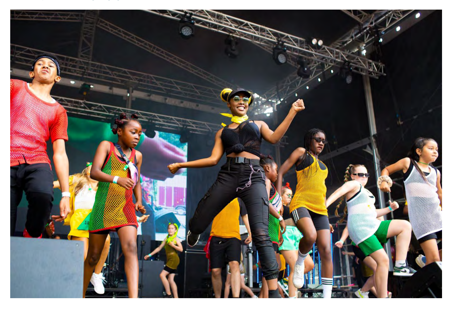
Urban Circle

As well as applications from dedicated youth organisations, such as National Youth Arts Wales, young people were considered extensively throughout, with the strongest applicant responses demonstrating a desire to give younger voices genuine, structural power. Our research has regularly highlighted that young people are systematically absent from the boards of arts organisations, with only two percent of the board membership of Arts Portfolio Wales in 2022/23 aged under 30 years old. Organisations like Frân Wen and Urban Circle, based in Newport, lead the way in not only platforming young people's voices, but in ensuring that those voices are at the heart of decision making and governance. Although the percentage of youth board membership will rise next year to three and a half percent, much more work is needed to develop leadership and strategic opportunities for young people.