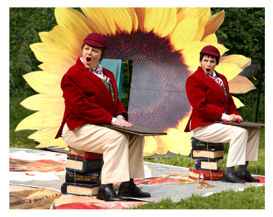
Welsh National Opera, Alice's Adventures in Wonderland

Amongst those working internationally, there is some recognition of the need to change ways of working. Welsh National Opera is working on creating an optimised touring structure and gaps between tour weeks will be avoided where possible to optimise the hiring and storing of equipment and vehicles.