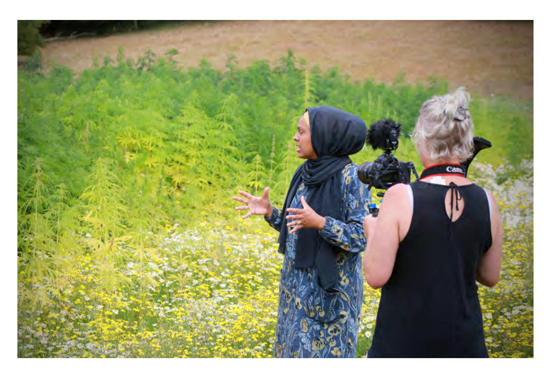
'Troi Tir' by Heledd Wyn; Image: © Trystan Hardy

In addition to these basic selection criteria, the panel will take into consideration the overall diversity of the 8 artists selected.